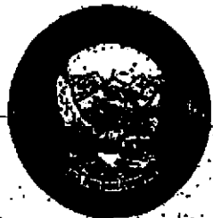
BARBARA K. CEGAVSKE Secretary of State

Electronic Certificate Certificate Number: C20160120-1373 You may verify this electronic certificate online at http://www.svsos.gov/